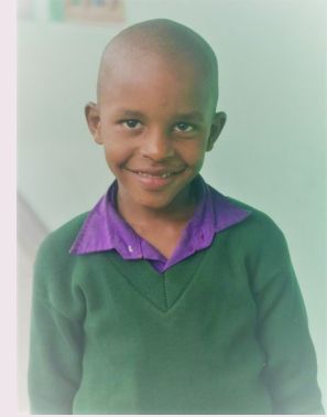
Prince Clement (Boy)